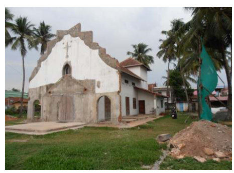
The Church main structure is maintained while renovating exterior

The project is comprising of an Administrative Block including the Parsonage for the Clergy and offices which is almost complete, renovation of the old Church without changing the original structure and building up a Heritage Center consisting of a Museum, library and research center